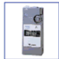
Iron Particle Density Meter